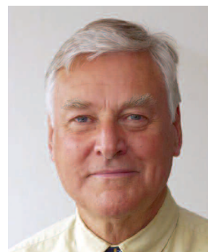
Kent Messenger Group